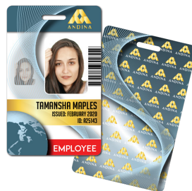
Photo ID Cards

Photo ID Cards are a great way to ensure staff are easily identified by customers. For added efficiency, incorporate a barcode, magnetic stripe or chip on the card that can be used to log into a POS system or payroll system.